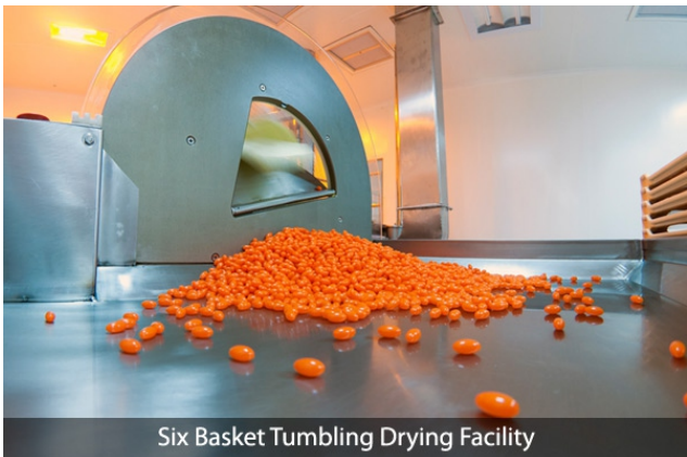
Six Basket Tumbling Drying Facility