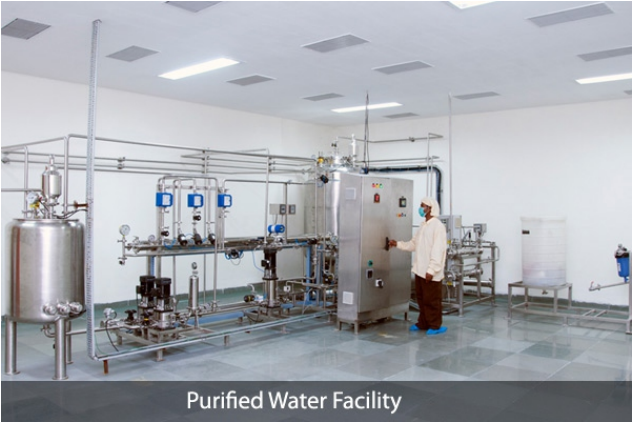
Purified Water Facility