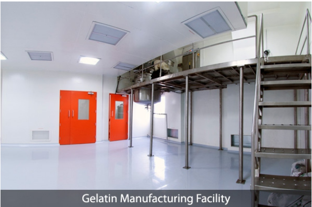
Gelatin Manufacturing Facility