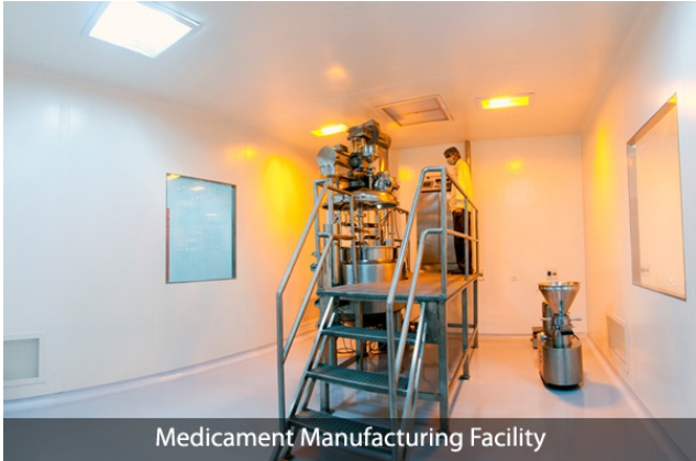
Medicament Manufacturing Facility