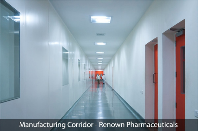
Manufacturing Corridor - Renown Pharmaceuticals