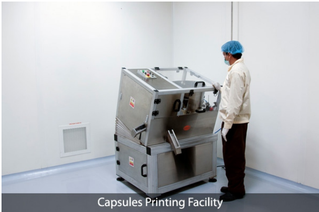
Capsules Printing Facility